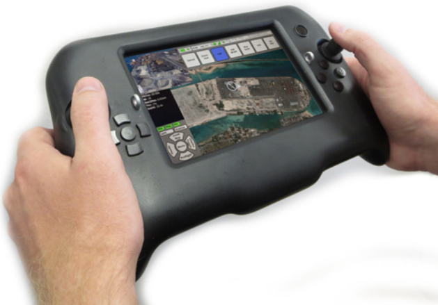
Lockheed Martin Procerus Hand Controller