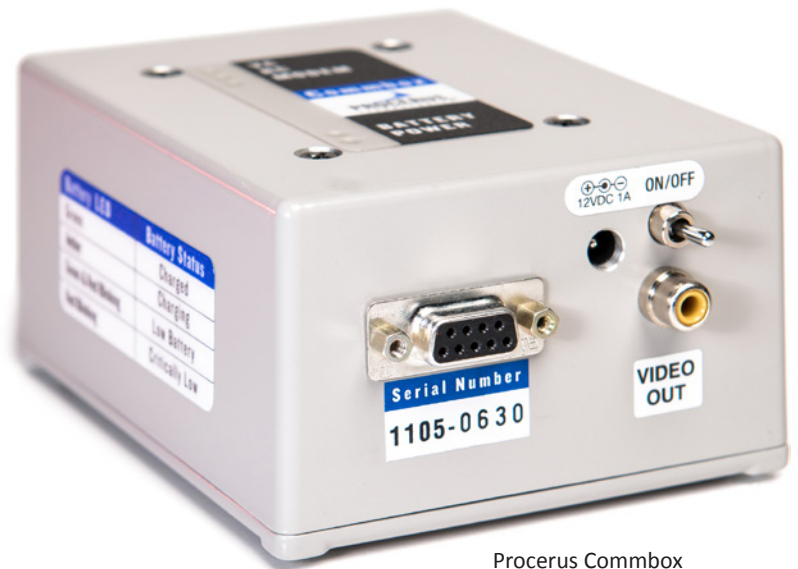
Procerus Commbbox 5" x 3.7" x 2" 16 oz